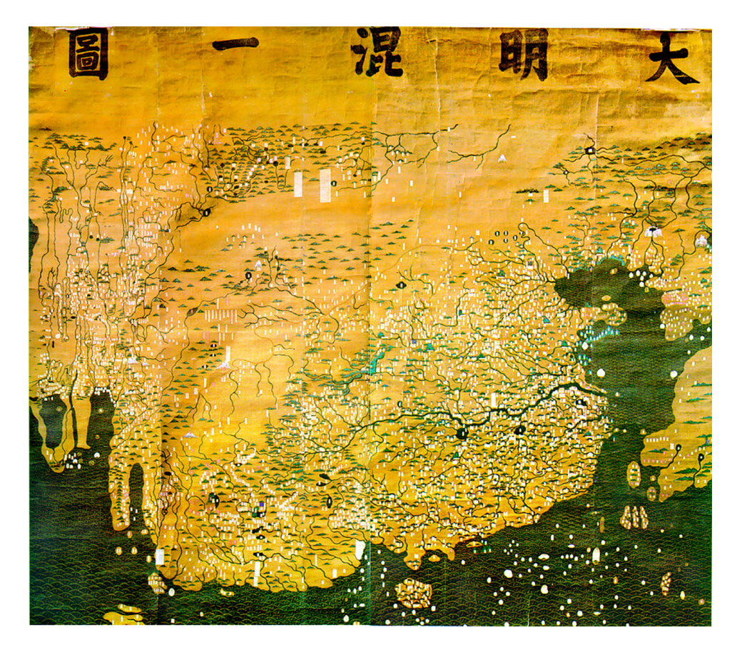
Figure 2. Surrounding landmasses are distorted to fit around China in 'Da Ming Hun Yi Tu' ('Amalgamated Map of the Great Ming Empire'). The map is 386×456 cm in size. https://upload.wikimedia.org/wikipedia/commons/c/cd/Da-ming-hun-yi-tu.jpg (accessed 19th of February 2017). Public Domain.