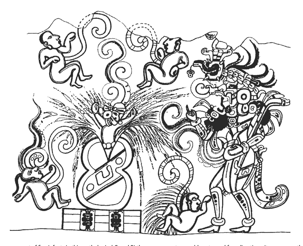
Figure 3. The arrangement of five infants in this mythological Gourd Birth scene suggests a world centre and four directions. It appears on the North Wall of the Mayan Pyramid of 'Las Pinturas' in Guatamala (Saturno, Taube, and Stuart, with renderings by Hurst, 2005: Figure 9, p.13. Used with permission.).