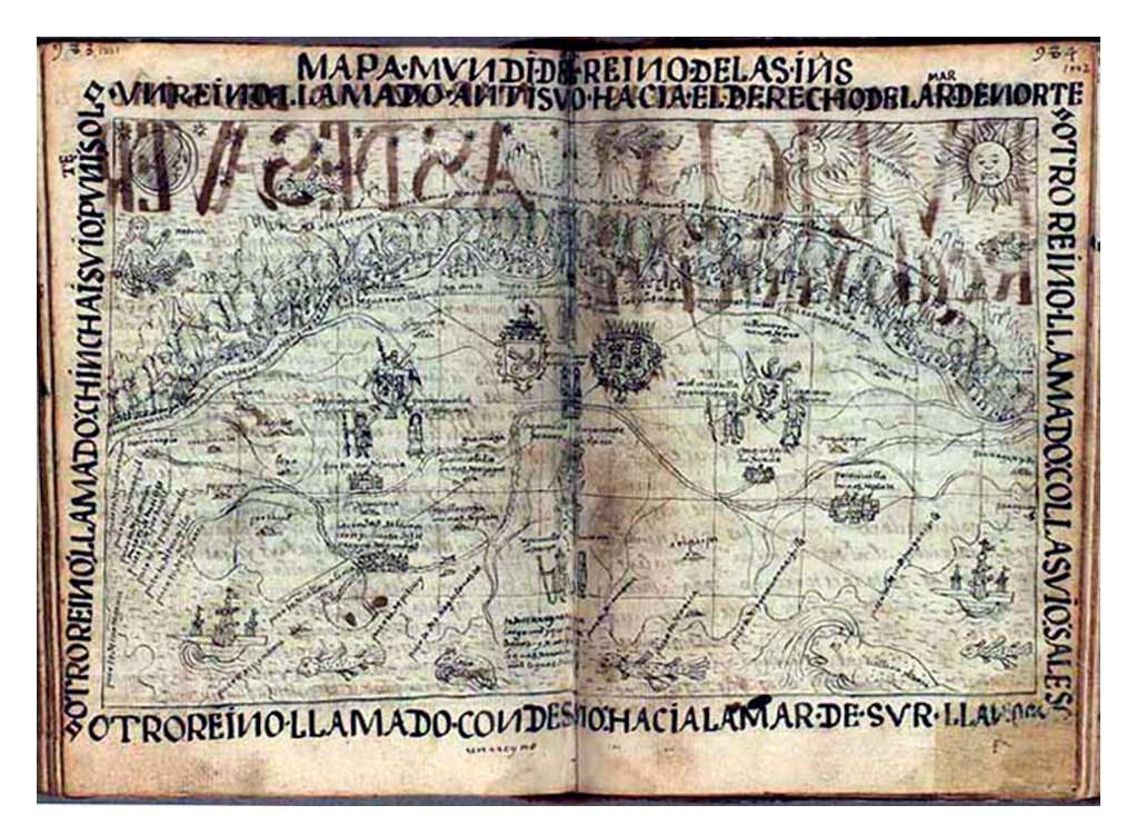
Figure 4. In sixteenth-century Peru, Felipe Guaman Poma de Ayala resisted the Spanish colonial power structure by depicting four world navels in his 'Mapa mundi de[l] reino de las In[di]as' ('World Map of the Kingdom of the Indies') (Royal Danish Library, GKS 2232 4°: Guaman Poma, El primer nueva corónica y buen gobierno, 1615/1616)

written in a blend of Quechua and Spanish. The chronicle makes deep and pained observations regarding sixteenth-century colonial Peru from the perspective of 'indigenous Andean resistance and consciousness' (Adorno, 2011: 77).<sup>2</sup> The volume includes a prophetic cosmological vision of the past and future of 'las Indias' and the globe, which explicitly includes four world navels (Wachtel, 1973; Adorno, 2000). Guaman Poma's chronicle, re-rooting multiple world navels, remains the longest and most important indigenous critique of European imperialism in written form.<sup>3</sup>