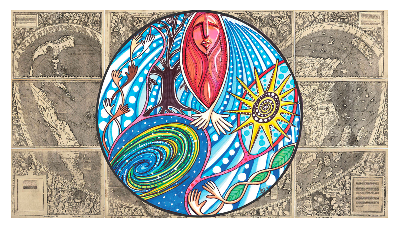
Figure 6. 'Caught in the Legend' by artist Larisa De Palma (commissioned by Rasmus Grønfeldt Winther) expresses the author's hope that we can counter dominant views such as the colonialist 1507 Waldseemüller Map. One way to decentre our perspective from reified world navels (such as the Sun, the genetic code) is by considering three other tropes or themes of centring: the tree of life (here represented in black) is a recurring theme of rooting and the sacred across many cultures; the vagina or vulva (here represented at the top, with an emergent face) has long been considered a life-giving centre, as in the Las Pinturas depiction (Figure 3), and as comparative mythology shows (e.g. Hindu and Chinese; Blackledge, 2004; Winther, 2020); third, the ocean (the variegated background) is another common symbol of centredness and origins, especially in cultures deeply connected with the oceans and seas. Through pluralistic decentring, we achieve a more balanced awareness of other aspects of our existence (the far galaxies, the multiplicity of human forms and cultures). As argued in Winther (2020), science also guides us toward a more integrative, holistic vision when it adopts pluralistic views and mappings of space, brains, bodies and genes. (Waldseemüller map: Library of Congress, Geography and Map Division).

Excavating and integrating world-navel maps is not an idle pursuit. It could lead to a more hopeful future, in science and perhaps in politics as well. In science, we can combine distinct theories or models, lay bare their respective domains of application and explanatory and predictive tools, and even hybridize them. A growing repository of centralized world-navel maps could be a most useful exercise for critical diplomatic, pedagogical and museological reflection. In any event, the universe is an interesting and variegated place, deserving of our most interesting and variegated representations.