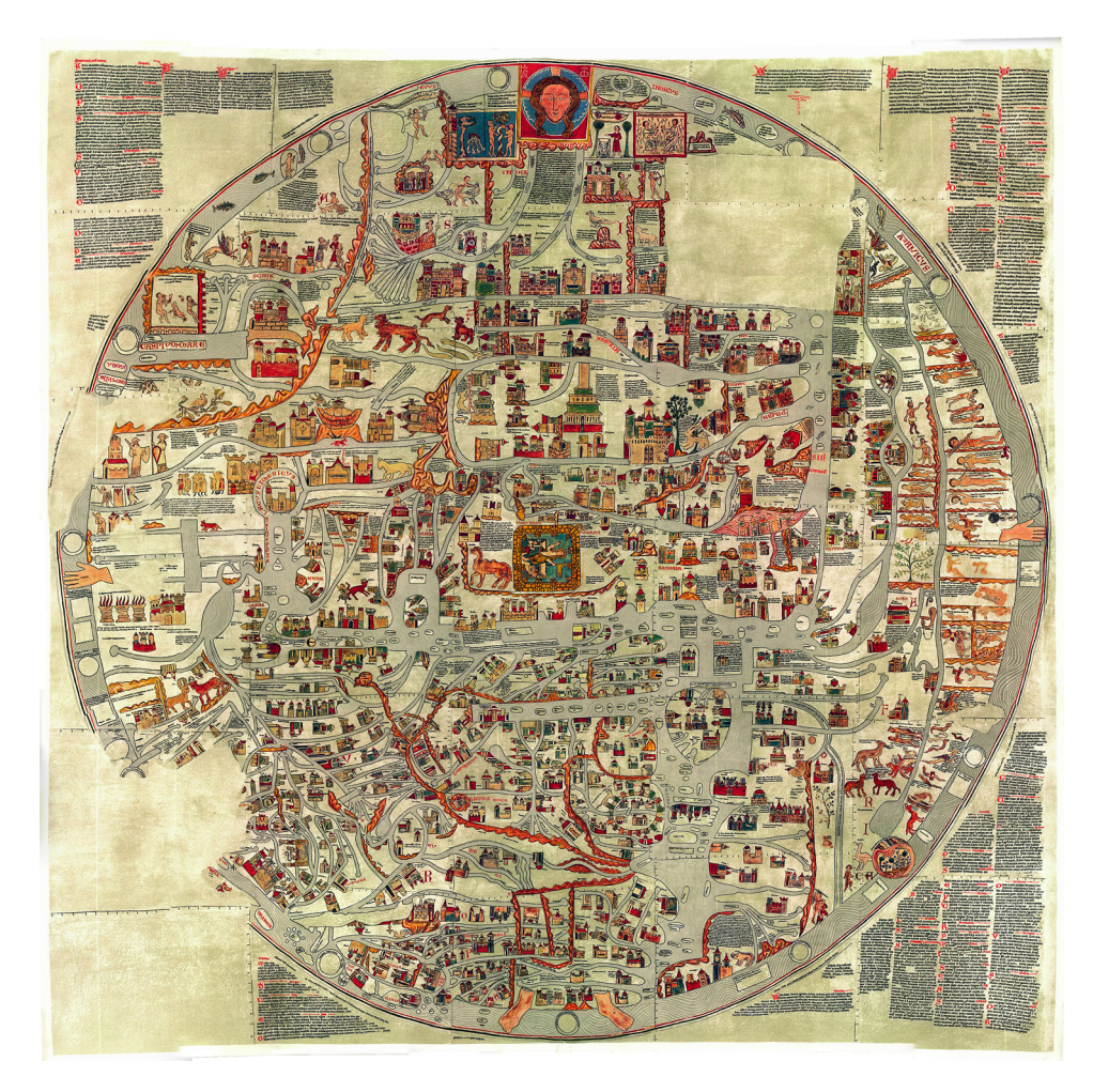
Figure 1. This map is probably from the late 13th century, perhaps created by nuns in a convent of Ebstorf in Lower Saxony. This 'T and O' arrangement, with Jerusalem at the center, was common in medieval world maps. The Ebstorf Map was the largest known European medieval map at about 3.6 meters squared (painted on 30 goatskins sewn together). The original was destroyed in Allied bombings of Hanover, Germany, in 1943. (Barber 2005, 58; Pischke 2014). https://en.wikipedia.org/wiki/Ebstorf_Map (accessed 19th of February 2017). Public Domain.

'navel of the moon', from Nahuatl, the Aztec (or Mexica) language (Anders et al. , 2001–2018). In their violent conquering lust, the Spanish assimilated and promulgated this cartographic and architectural vision as the Zócalo, which today remains the centre ('el centro') of Mexico City.